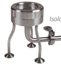
Isolator Monitoring Kit