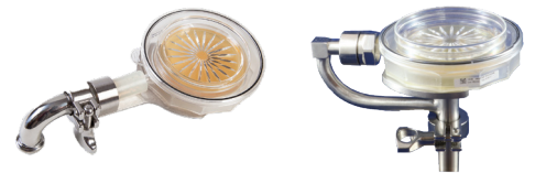
Elbow (left) and Bottom (right) sampling adaptors for remote connection to BioCapt® Single-Use

BioCapt® and MiniCapt® are registered trademarks of Particle Measuring Systems, Inc. All other trademarks are the property of their respective owners. Particle Measuring Systems, Inc. reserves the right to change specifications without notice. © 2018 Particle Measuring Systems, Inc. All rights reserved.