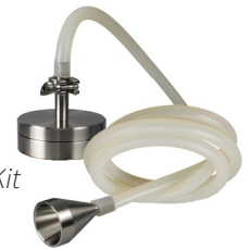
Remote ISP Sampling Kit